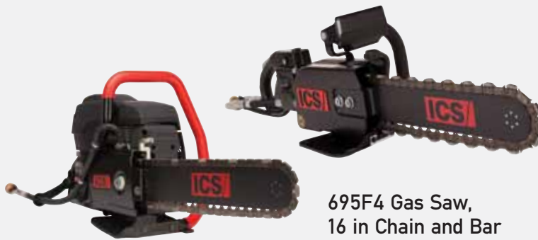
695F4 Gas Saw, 16 in Chain and Bar